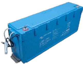
Secured with mounting brackets