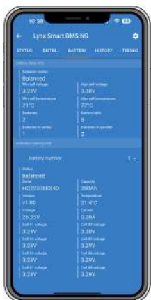
Complete overview of all battery data via VictronConnect (or a GX device and VRM)

Victron Energy Lithium NG batteries are Lithium Iron Phosphate (LiFePO 4 or LFP) batteries available in various capacities with nominal voltages of 12.8 V, 25.6 V and 51.2 V. They can be connected in series, parallel, or a combination of both to create battery banks for system voltages of 12V, 24V, or 48V. A maximum of 50 batteries can be used when configuring a bank with 12V or 24V batteries, while up to 25 batteries can be used with 48V batteries. This allows for a maximum energy storage capacity of 192 kWh with 12V batteries, up to 384 kWh with 24V batteries, and 128 kWh with 48V batteries.