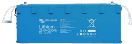
25,6 V 200 Ah Lithium NG battery