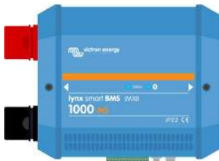
Lynx Smart BMS NG 500 A & 1000 A