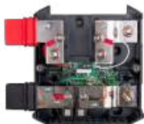
Lynx Shunt VE.Can (M8) without cover