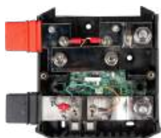
Lynx Shunt VE.Can (M10) with fuse dummy busbar installed