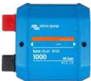
Lynx Shunt VE.Can (M10) model