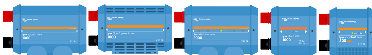
The Lynx modules: Lynx Power In, Lynx Class-T Power In, Lynx Distributor, Lynx Shunt VE.Can and Lynx Smart BMS