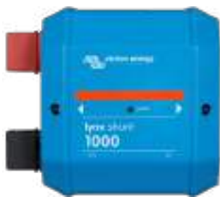
Lynx Shunt VE.Can (M8) model